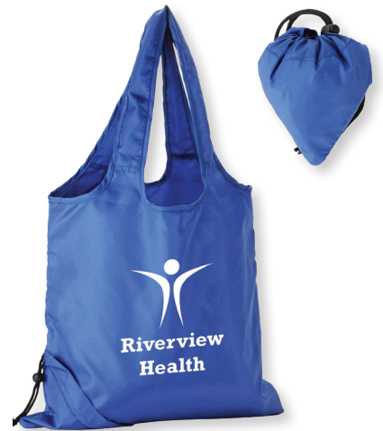
Eco Foldaway Tote